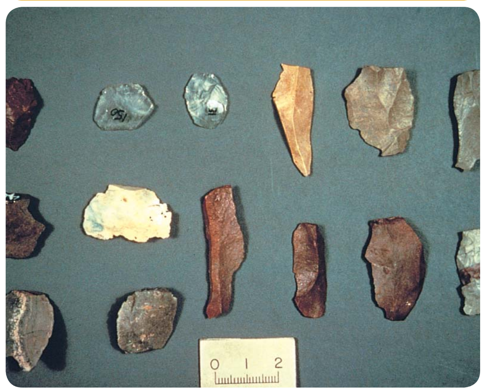
A group of artefacts of different size, shape and material